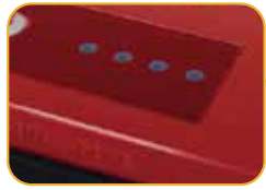
● 4 Power Indicator