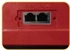
● Terminal Communication Interface