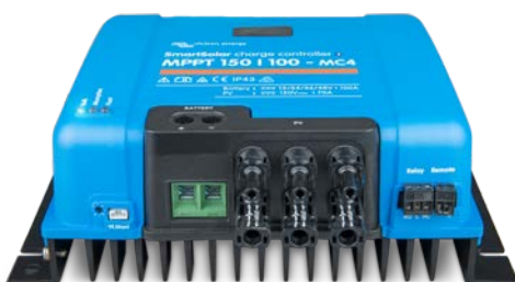
SmartSolar Charge Controller MPPT 150/100-MC4 without display