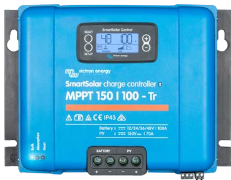
SmartSolar Charge Controller MPPT 150/100-Tr with pluggable display