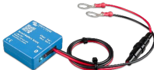
Bluetooth sensing: Smart Battery Sense