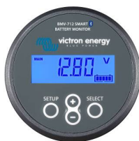
Bluetooth sensing: BMV-712 Smart Battery Monitor