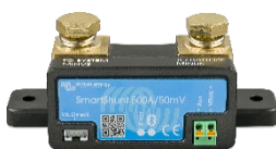
Bluetooth sensing: SmartShunt