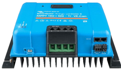
SmartSolar Charge Controller MPPT 150/100-Tr VE.Can without display