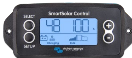
SmartSolar pluggable display

Simply remove the rubber seal that protects the plug on the front of the controller, and plug-in the display.