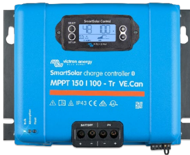
SmartSolar Charge Controller MPPT 150/100-Tr VE.Can with optional pluggable display