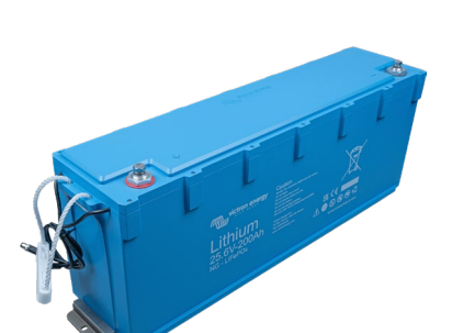
Secured with mounting brackets